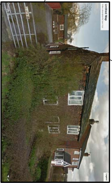
15 Mill House Lane, Benefice Farm